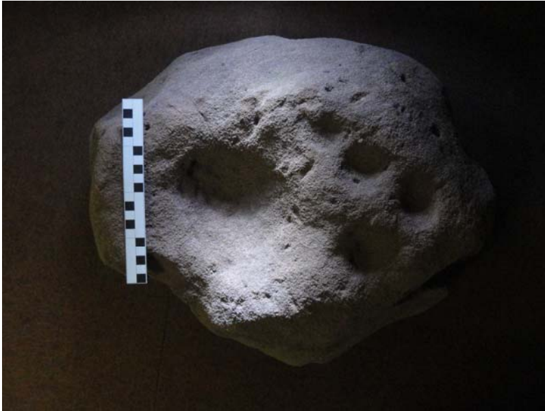
Sandstone boulder decorated with Bronze Age 'rock art'

All of this labouring ultimately proved to be rewarding when one of the boulders was discovered to be decorated with a form of Bronze Age rock art known as 'cup marks'. This art work together with finds of Bronze Age pottery and flint work (including a barbed and tanged arrowhead) clearly demonstrate that Eddisbury hill was an important site long before the Iron Age hillfort was built.