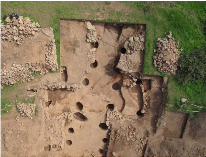
The re-excavated remains of the hillfort's south-east entrance

As with our earlier work on Woodhouse and Helsby hills we were primarily concerned with the re-excitation of old trenches; in this case originally excavated by William Varley between 1935 and 1938. Specifically, we wanted to re-expose sections through the inner and outer ramparts in order to retrieve samples for scientific dating and analysis; however, we also took the opportunity to re-excavate the eastern entrance in order to assess the condition of the buried structural remains. The Merrick's Hill area of the hillfort was also re-examined by a 40 strong team of students who were using the excavation to gain valuable field experience as part of a formal 2 week field school organised by Liverpool University.